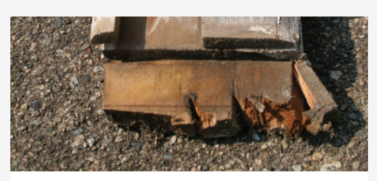
TRADITIONAL WOOD FRAME Susceptible to rotting, warping and decay

PLASTPRO PF<sup>™</sup> DOOR JAMB *with Hydroshield Technology<sup>™</sup>